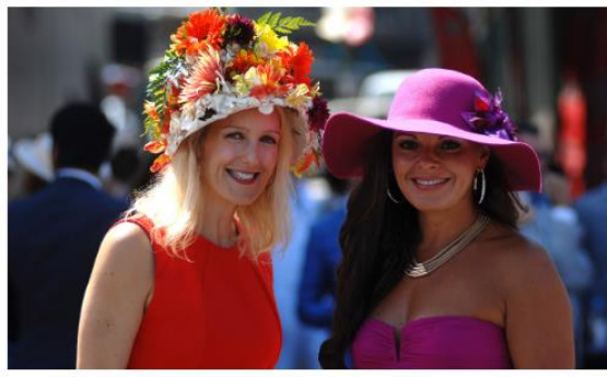
Prestigious Lifestyle Atmosphere