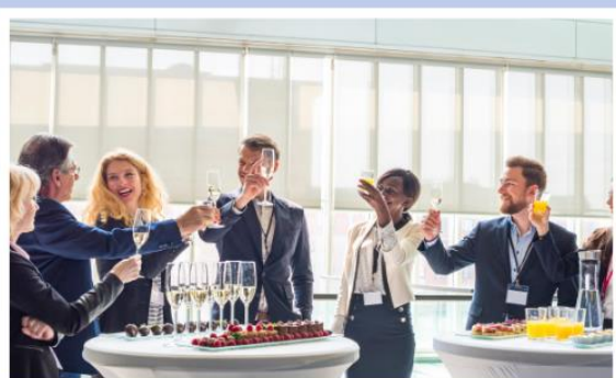
Food Court & Music