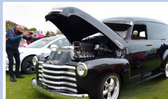
Car-Related Activities for Adults