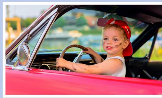
Kids' Zone with plenty of car-related activities